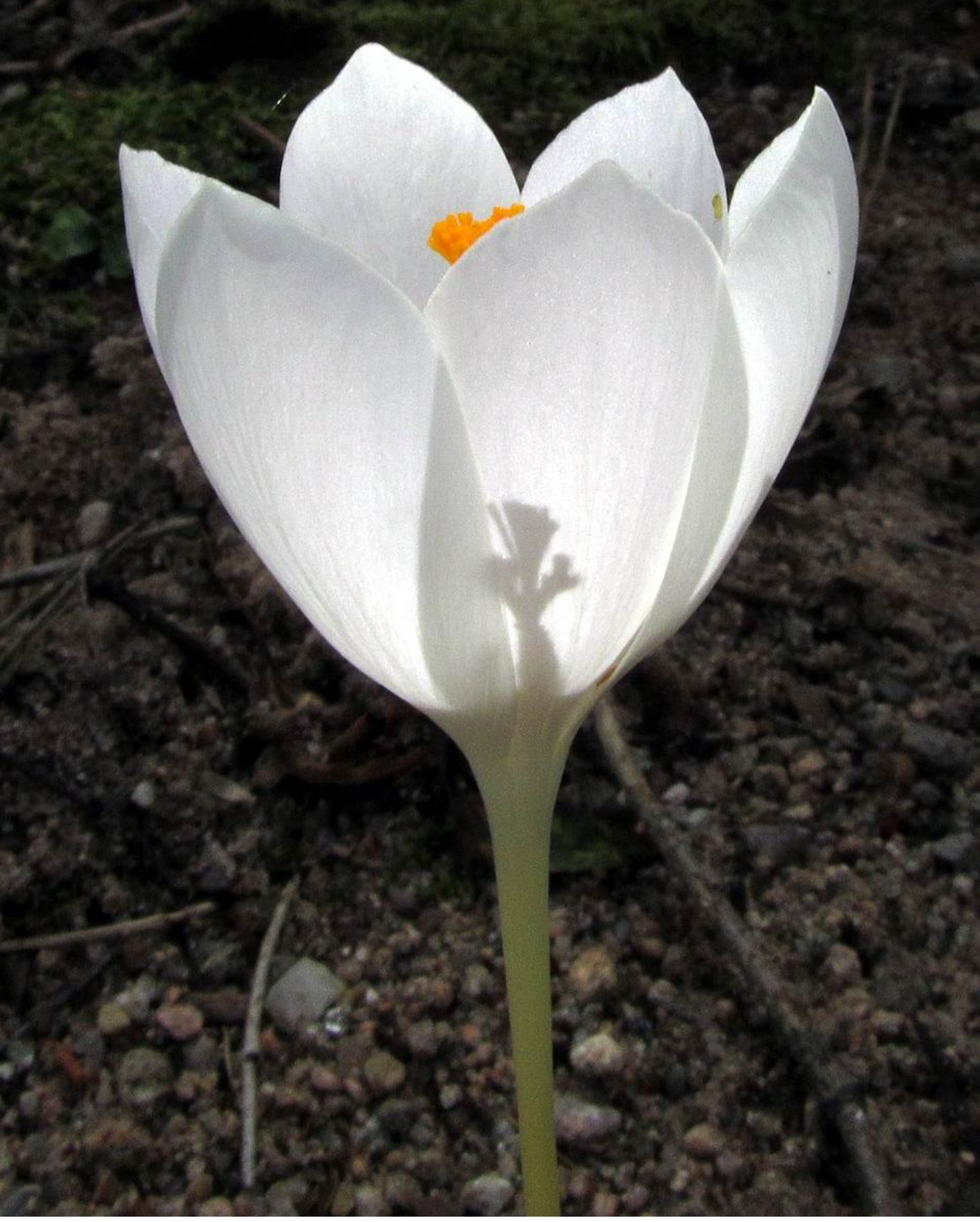
Crocus nudiflorus white seedling