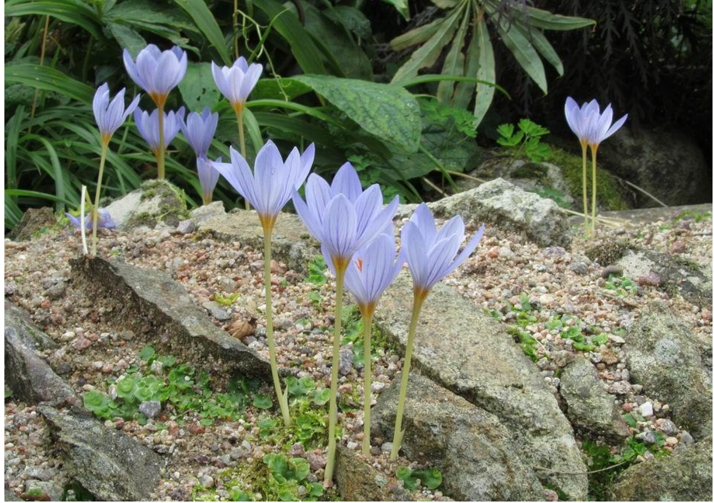
More of the Crocus speciosus hybrids in the sand bed that I showed last week are now opening revealing the variation through the seedlings many with white pollen like the one below.