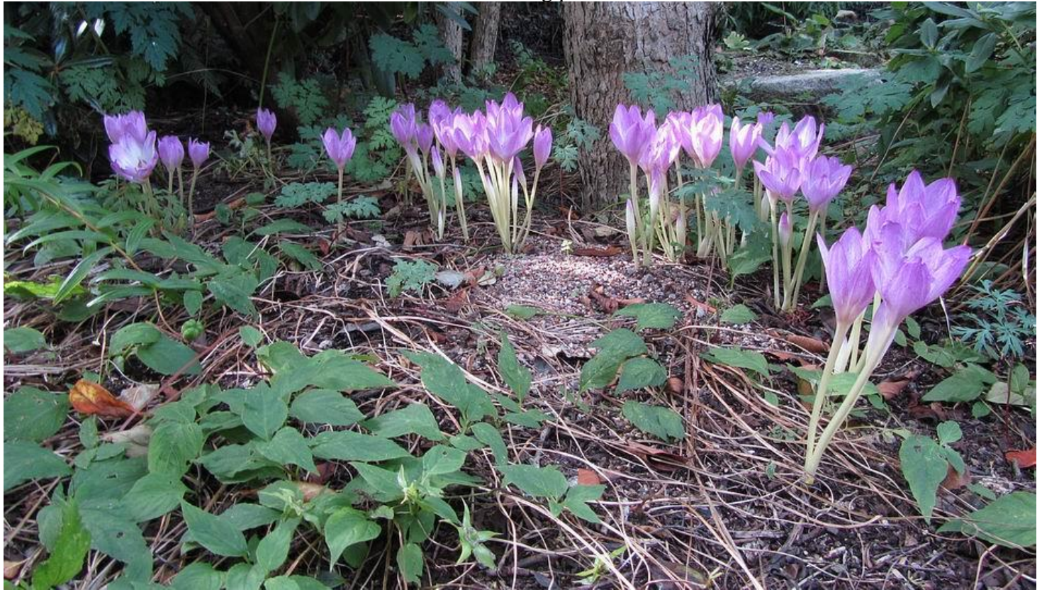
I don't know how many will be left standing because as I write, on Tuesday morning, we are being battered by the most dreadful storm - lashing rain and gale force winds have already brought down branches on an Acer...