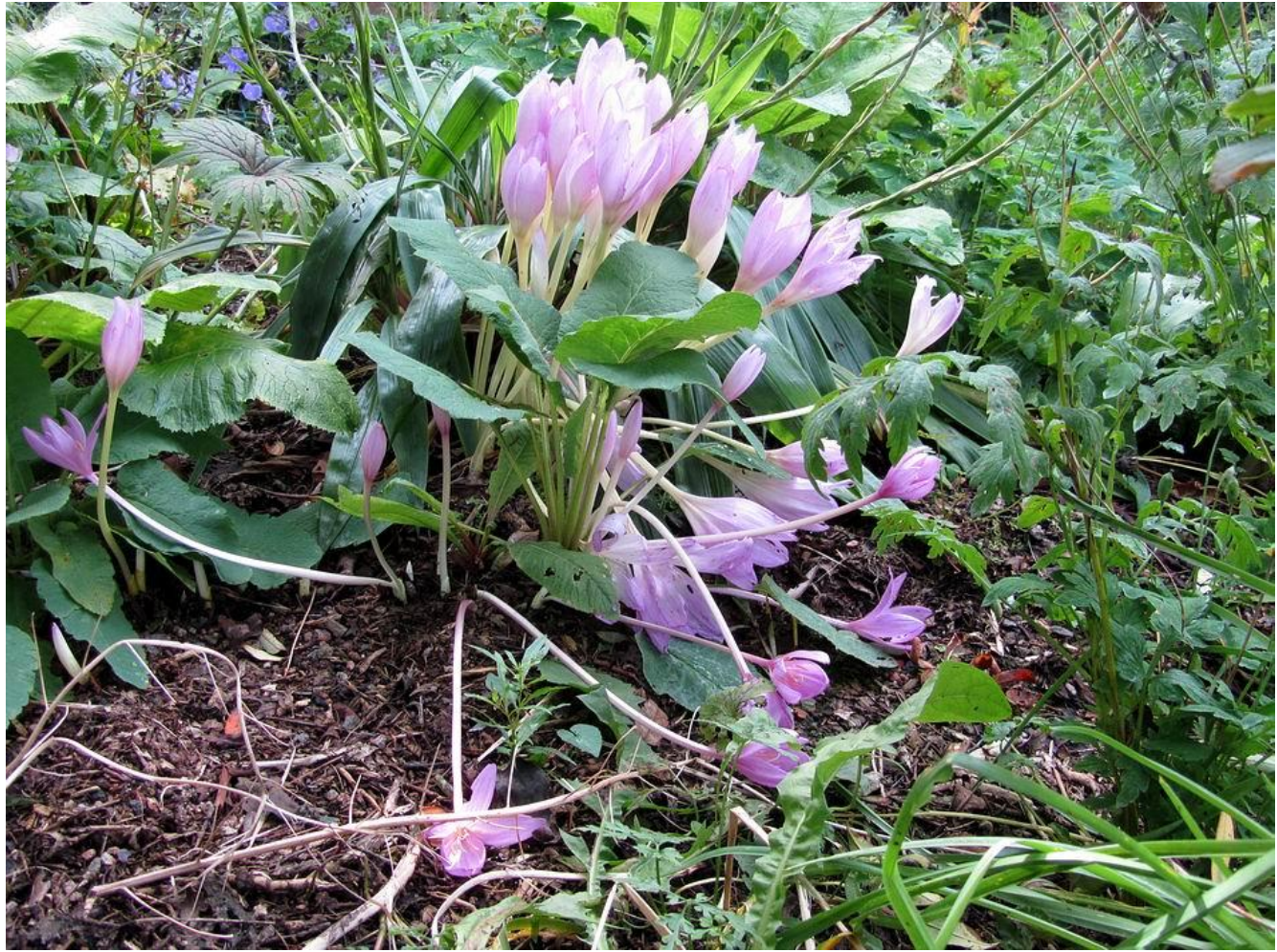
Colchicums are the main flowering feature in the garden just now with their magnificent flowers.