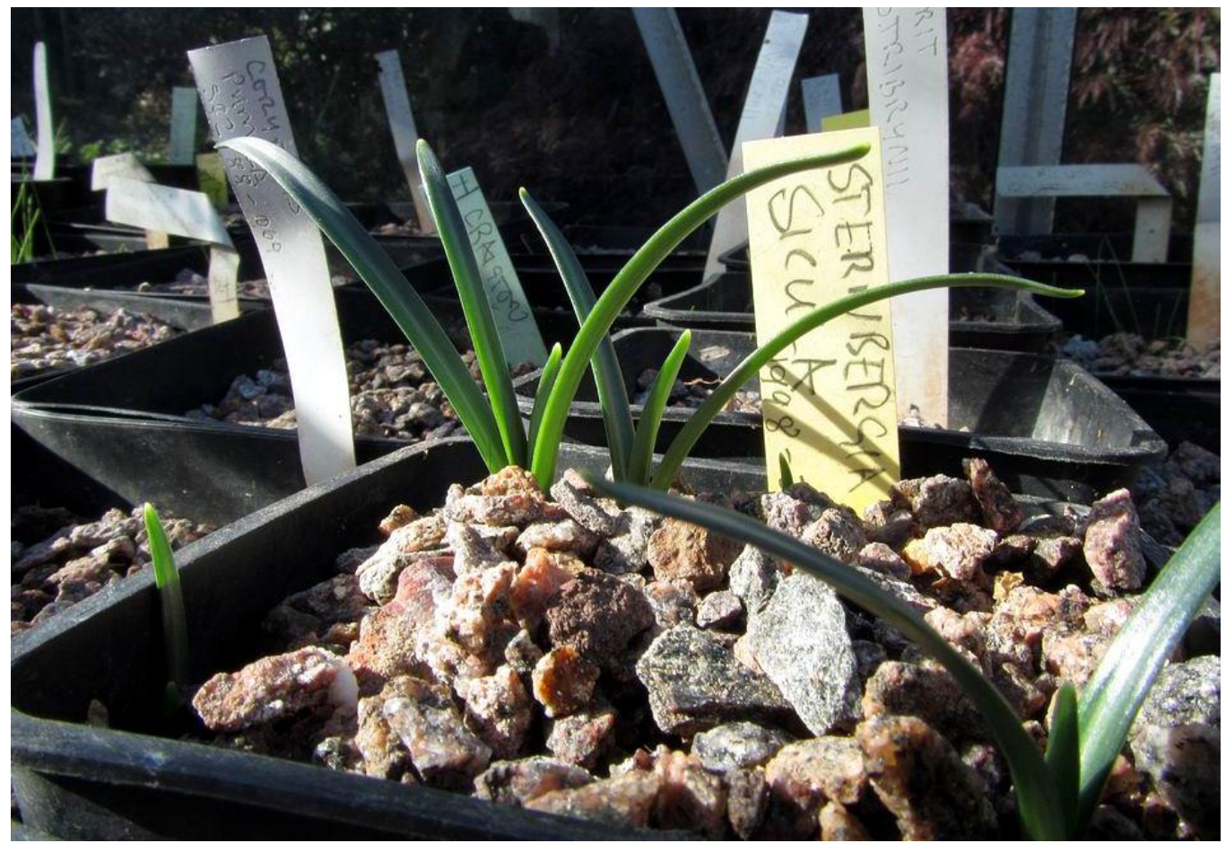
I have been enjoying wonderful pictures of Sternbergia flowers on the <u>forum</u> how I wish we could flower them so well here in Aberdeen. I can grow most of them but we just do not get enough heat to ripen the flower buds as they go dormant in the late spring – time will tell if I get any flowers this year...