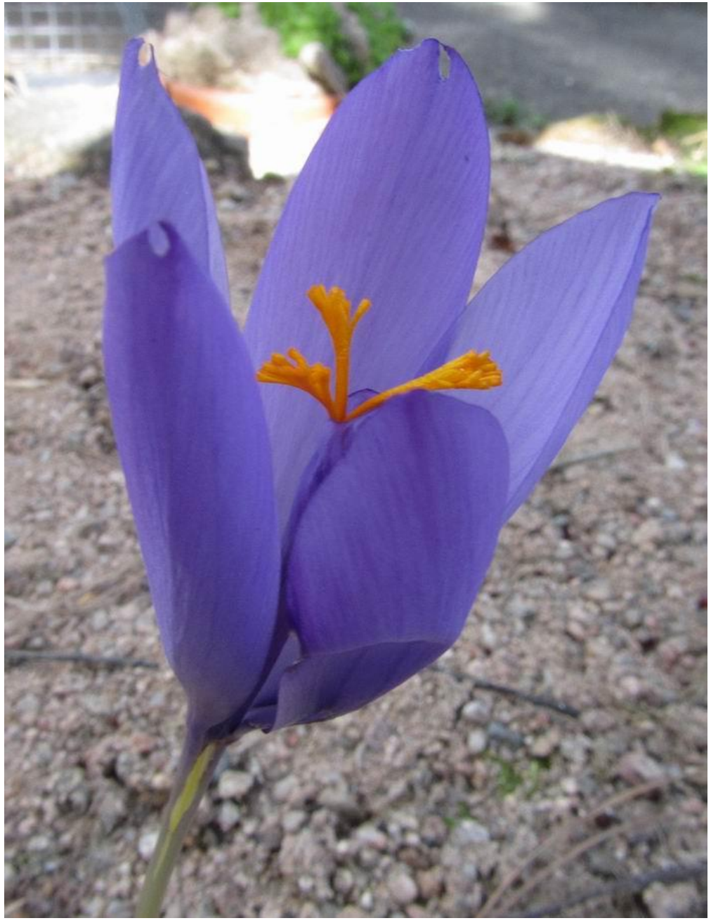
Below is a picture of Crocus nudiflorus to remind you of the more commonly seen colour

It is wonderful to have white forms to mix in and to contrast with the plantings of the purple forms.